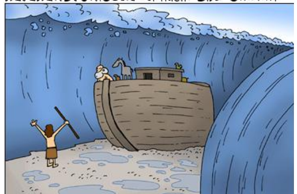
02-07-2014 MOSES AND NOAH HAVING AN ARGUMENT

Thankfully this time it didn't actually overflow or cut the